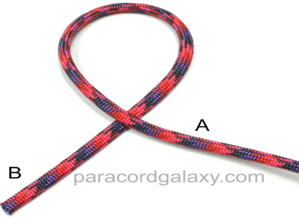
Form a loop with "A" crossing over "B"