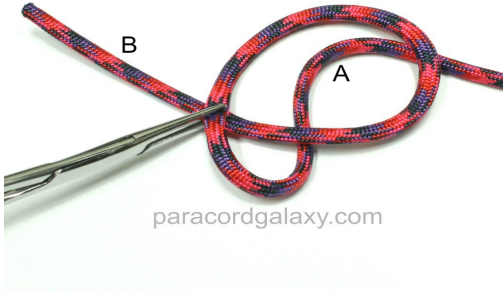
Bring "A" under the loop