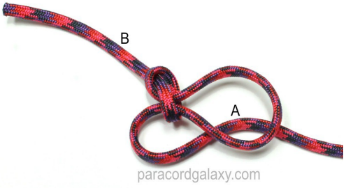
Repeat the process by bringing "A" behind the new loop