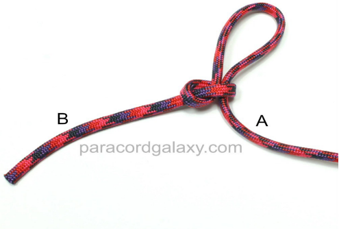
Tighten the loop by pulling on "B"